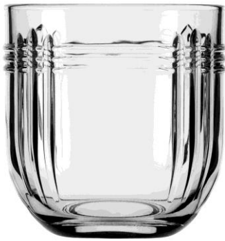
Rocks Item No. 2970VCP29 9 \frac{3}{4} oz./290 ml H3 \frac{3}{4} " T3 \frac{1}{2} " B1 \frac{5}{8} " D3 \frac{1}{4} " 1 doz./3# • .29 cu. ft. SCC 8710964826982